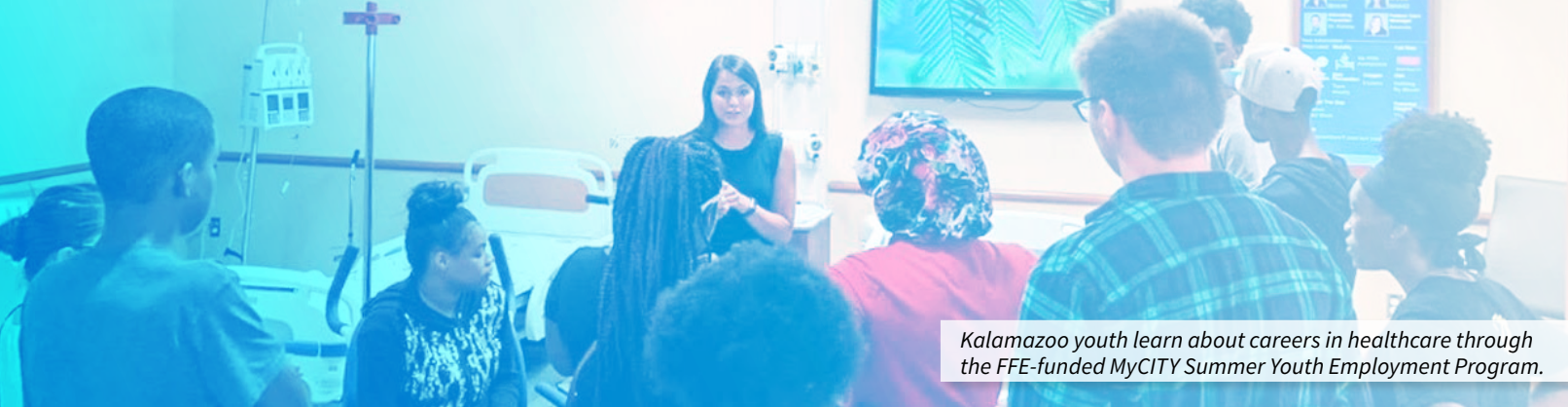
Kalamazoo youth learn about careers in healthcare through the FFE-funded MyCITY Summer Youth Employment Program.