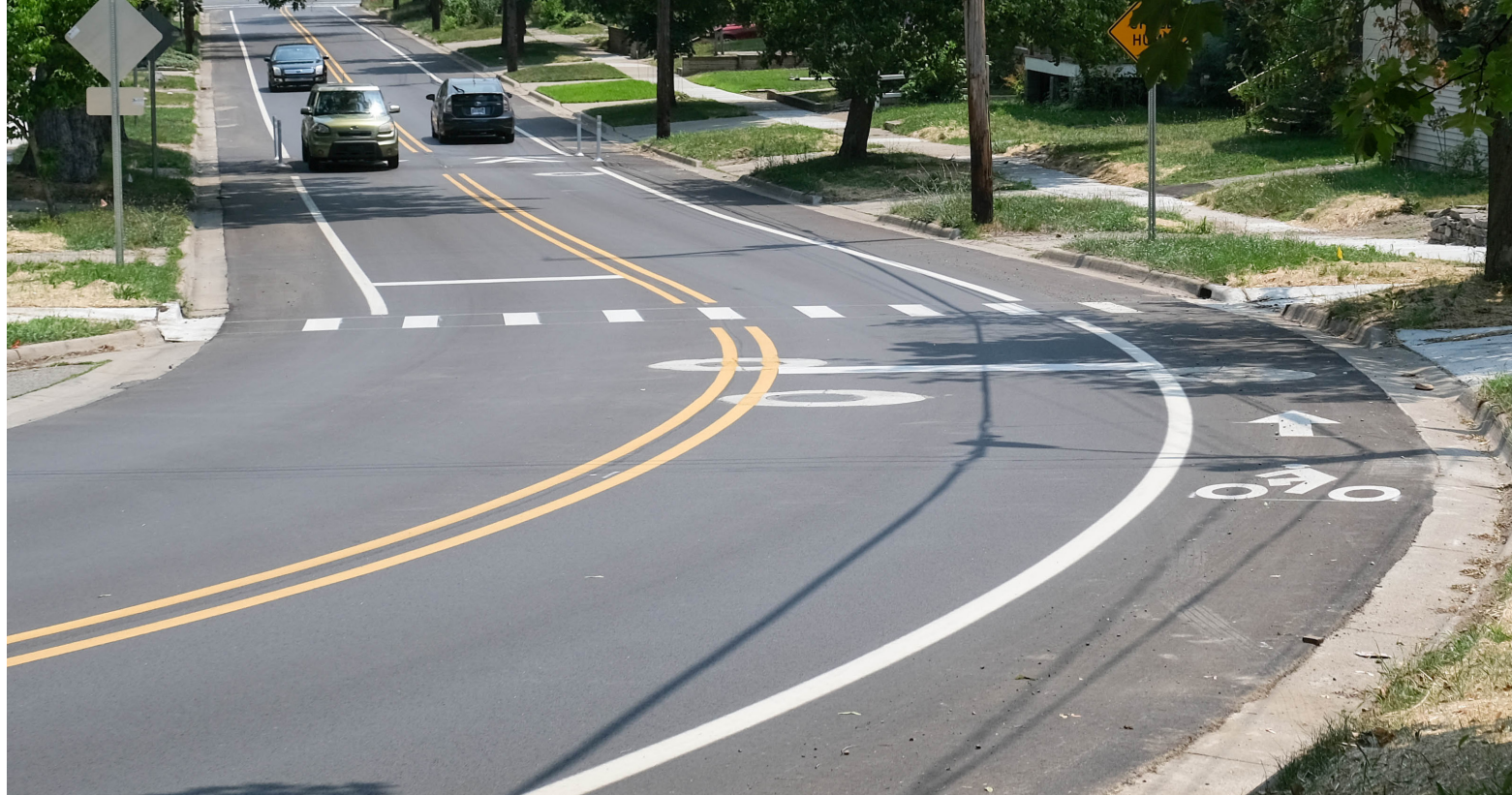
With speed humps, bike lanes, and new sidewalks, FFE helped make Maple Street much safer and friendlier for residents.

A city that is networked for safe walking, biking, riding, and driving.