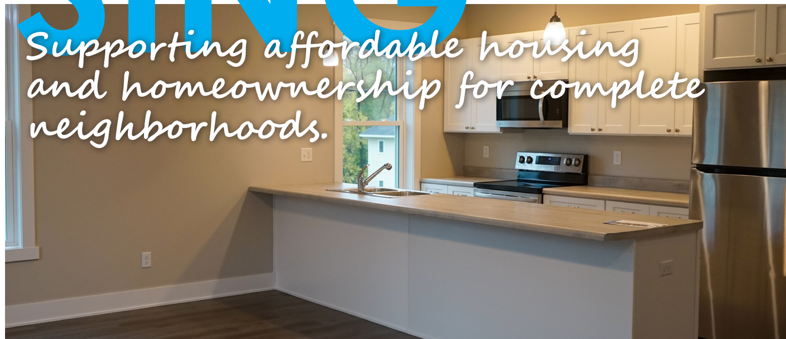
The interior of a typical Kalamazoo Attainable Homes Partnership home.

Supporting affordable housing and homeownership for complete neighborhoods.