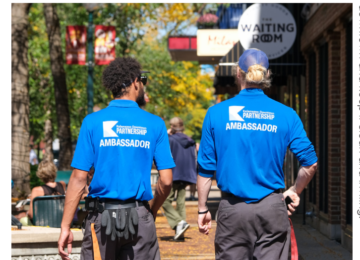
Downtown Ambassadors help visitors downtown and keep it clean and inviting.