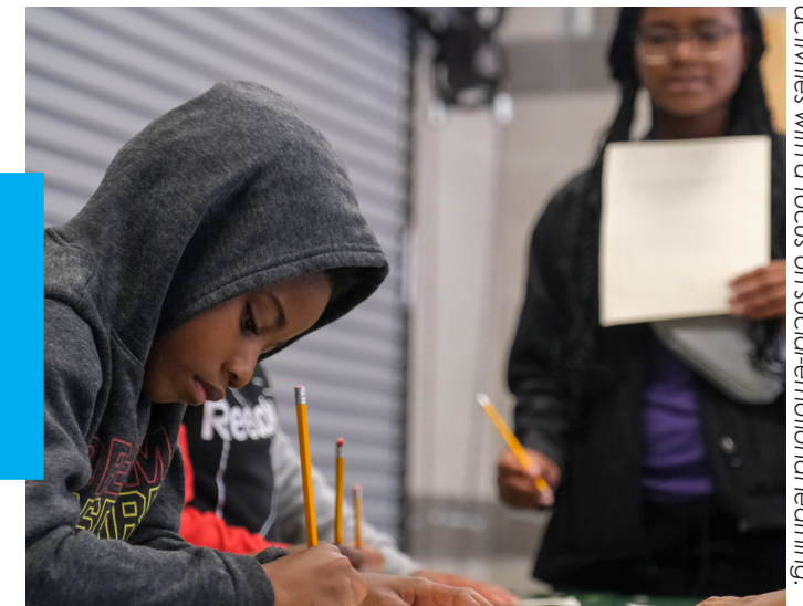
All Kzoo Parks summer camps include educational activities with a focus on social-emotional learning.

participants the opportunity to be involved in a variety of internships and gain new experiences and skills.