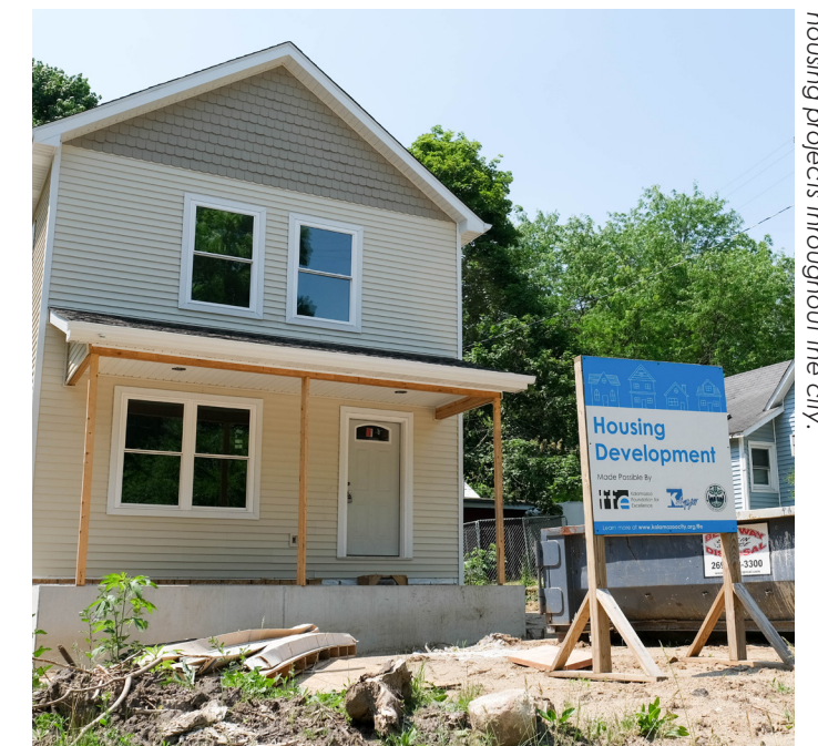
You can find blue signs like this one at FFE-funded housing projects throughout the city.

In addition to receiving assistance, the resident revealed, "The best thing about it all, was that everyone was so kind."